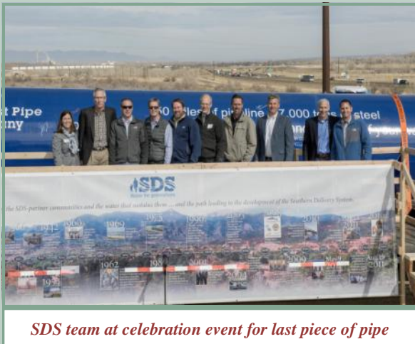
SDS team at celebration event for last piece of pipe

The SDS reached a key milestone on March 18, 2015 celebrating the completion of a major portion of the $829 million project. Since construction began in 2010, more than 7,000 sections of mostly 66-inch diameter pipeline has been installed in both Pueblo and El Paso counties. SDS is now closer to delivering water to Colorado Springs, Fountain, Security, and Pueblo West.