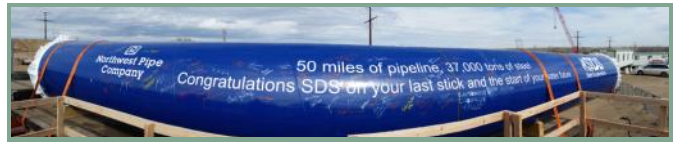
Last piece of pipe to complete the 50-mile pipeline

June 22: Planning, Partnerships Make 50-mile Water Pipeline Successful